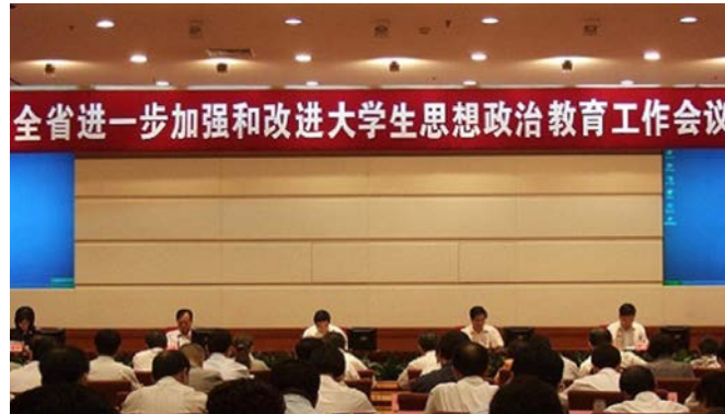
Fig.1. Convening a Conference on Ideological and Political Education for College Students

This is fundamentally different from the ideological and political education that used to solve the problem and accomplish the task. In essence, people-oriented, the main body is identified as a student, and the development of students is emphasized. This is highly consistent with the ideological and political education of the students in the school. The conference on convening ideological and political education for college students is shown in Figure 1.